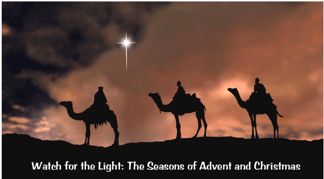
Watch for the Light: The Seasons of Advent and Christmas